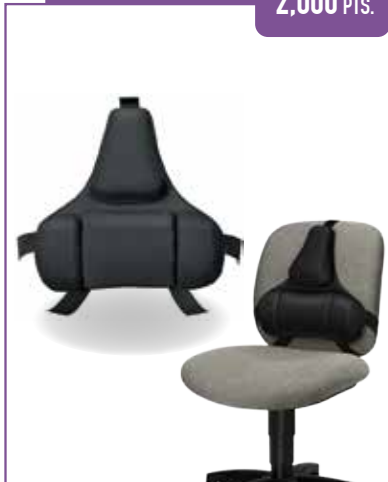
1,000 PTS. + 36,500 LL Back Support, ultimate pro, black color