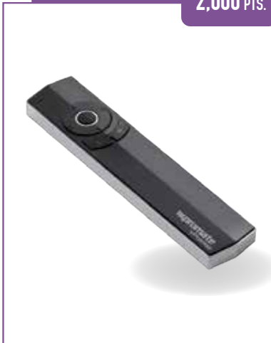
1,000 PTS. + 36,500 LL Wireless pointer for presentation