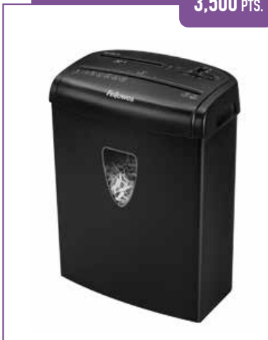
1,750 PTS. + 66,000 LL Fellowes shredder 8 sheets into 4x35 mm Separate slot for shredding CDs