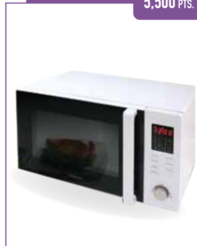
2,750 PTS. + 125,000 LL Kenwood white microwave with grill, 25L